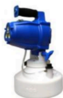
Sanosil Easy Fog